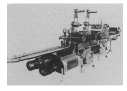
MARGARINE PACKAGER Lynch Machinery has introduced

Varian Associates Instrument Division has introduced an automated GC system, Vista 44, that combines the firm's Vista 401 Data System with up to four microprocessor-based Vista GC 4600 gas chromatographs. The 401 unit is used to establish setpoints and code and transmit them to the GC system, where the microprocessor automatically programs the correct parameters. The GC microprocessor transmits signals to the data system for real-time CRT status displays. Contact: Varian Associates, 611 Hansen Way, Palo Alto, CA 94303.